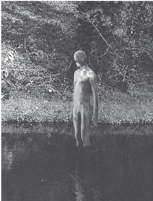
Bell's Mill Figure

Under the title '6 times' Antony Gormley and the National Galleries of Scotland are proposing a multi-part work which would position six life-size cast iron figures between the Scottish Gallery of Modern Art grounds and the sea at Leith, with four of the figures situated at various points along the Water of Leith.